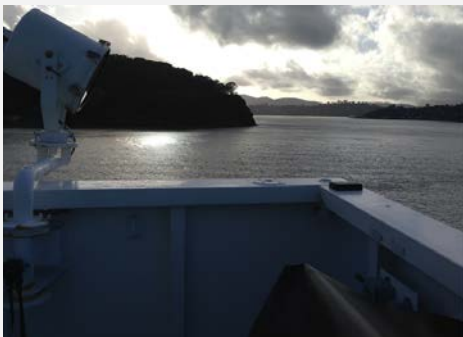
Unit placed in bridge wing (GPS mode)