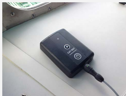
Typical location in wheel house